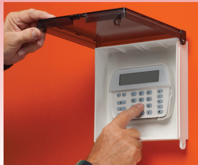
(keypad not included)